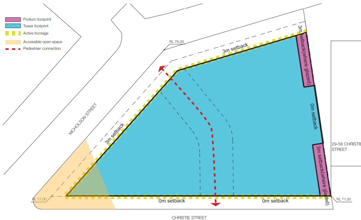
Figure 1 - Land and development covered by this plan

ST LEONARDS Block 4 – Nicholson Precinct